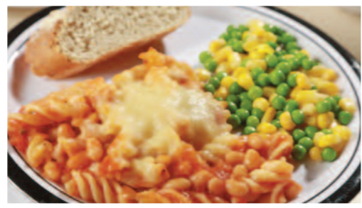
Cheesy Bean Pasta served with Garlic & Herb Bread and Seasonal Vegetables