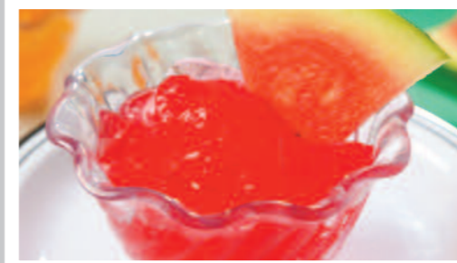
Jelly & Fruit