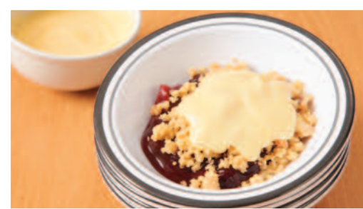
Fruit Crumble & Custard