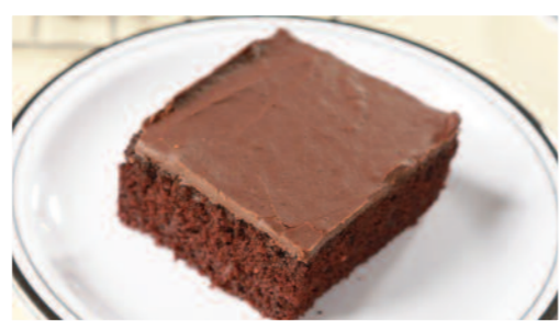
Iced Wacky Chocolate Cake