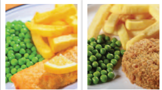
Battered Fish (MSC) served with Chips & Peas or Baked Beans or Salmon & Sweet Potato Fishcake (MSC) served with Chips & Peas or Baked Beans

VEGETARIAN VERSIONS OF THE ABOVE MEAL AVAILABLE DAILY