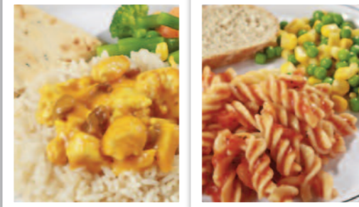
Fruity Chicken Curry served with Rice, Naan Bread & Seasonal Vegetables or Tomato & Basil Pasta served with Garlic & Herb Bread and Seasonal Vegetables