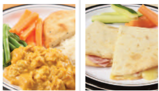
Chicken Korma served with Rice, Naan Bread & Seasonal Vegetables or Hot Cheese & Ham Wrap served with Carrot & Cucumber Sticks