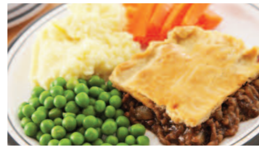
Homemade Mince Beef Pie served with Mashed Potatoes & Seasonal Vegetables