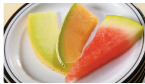
Trio of Melon