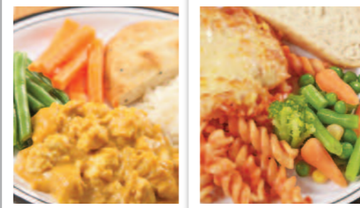
Chicken Korma served with Rice, Naan Bread & Seasonal Vegetables or 3 Cheese & Tomato Pasta served with Garlic & Herb Bread and Seasonal Vegetables